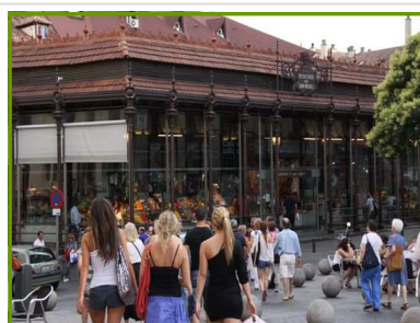
San Miguel Market